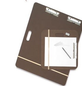
Drawing Board -large