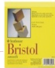
Bristol Board Pad 14x17