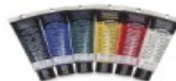
Liquitex Basic paint 4oz tubes